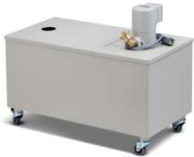
Recirculating System Included