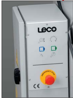
Convenient easy-to-operate control panel